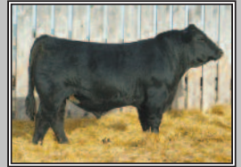
Daume Lucky Deal L101