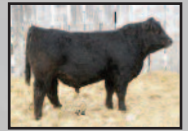
Kappes Bottom Line 2009 $6,500 High-Seller