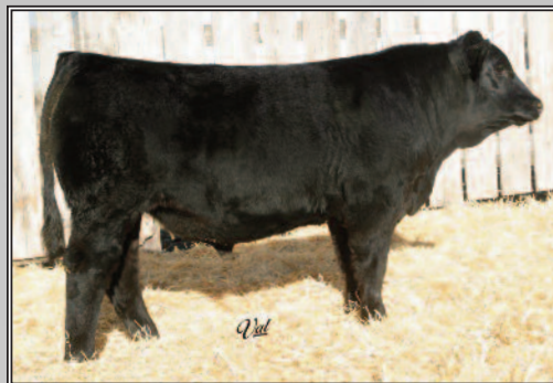
Kappes Yukon S522

Yukon is doing a nice job of serving as a clean up sire. He presents excellent EPDs numbers for CE and YW.