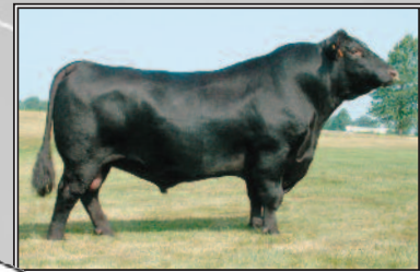
G A R Predestined

B/R New Design 036 x G A R Ext 4206 Purebred Angus