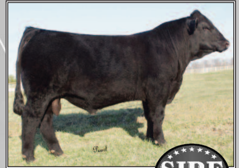
Kappes Trailblazer S516