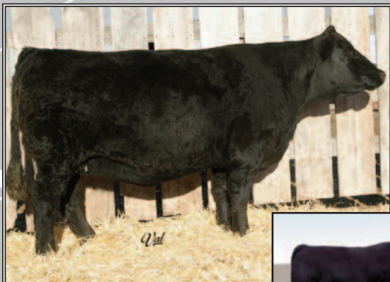
Kappes Sadie M166