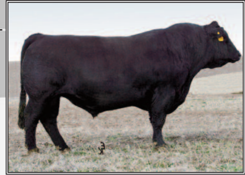
GW Lucky Man 644N