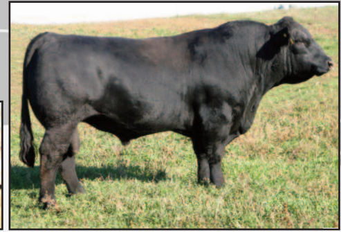
Triple C Invasion R47K