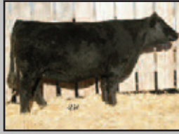
Kappes Sadie M166