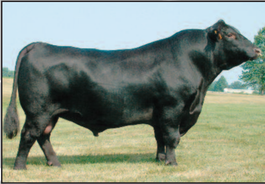
G A R Predestined