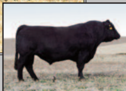
GW Lucky Man 644N

Sadie M166 has set the performance bar in our cowherd. She consistently has some of the highest performing embryo transplant calves. Her sons have topped several of our production sales. Sadie is homozygous polled. This year we added a new segment to the offering of Sadie sons sired by the Angus carcass king - G A R Predestined, and Simmental sires GW Lucky Man and Triple C Invasion. All three of these sires are homozygous black and homozygous polled.