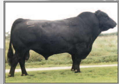
DHD Traveler 6807

He produces very functional, moderate framed offspring that are bold sprung in their rib shape.