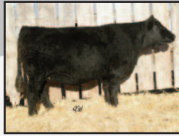
Kappes Sadie M166