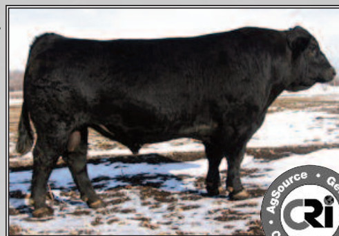
Hooks Shear Force 38K

Shear Force does a tremendous job of combining calving ease, unassisted births, maternal and carcass strength in a moderate framed, smooth made package.