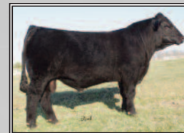
Kappes Trailblazer S516

This is a smooth made, long sided bull with muscle expression with genetics that provide maternal and phenotype strength.