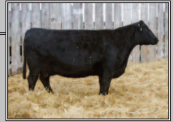
S A V Pride 7021

D H D Traveler 6807 x (5015) N Bar Emulation EXT Purebred Angus